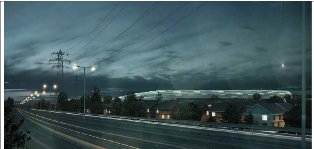
View to the stadium from the South East from the M1