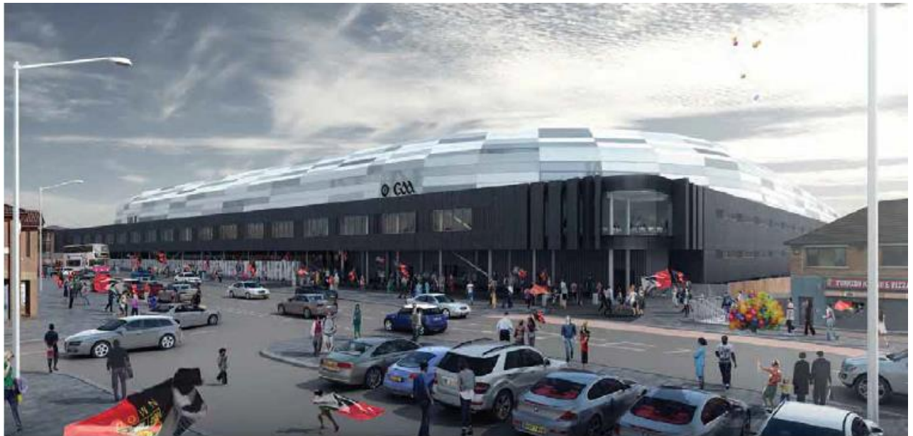
Andersonstown Road Facade looking east